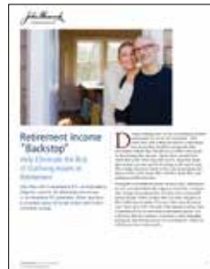
Retirement Income Backstop Journal Article