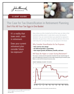
Tax Diversification Client Guide (Client Approved)