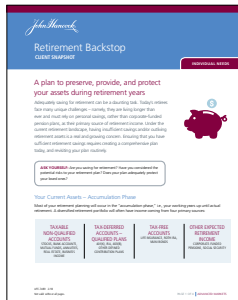
Client Snapshot (Client Approved)

A Retirement Backstop plan funded with permanent life insurance can help address the risks your clients face in retirement, such as outliving assets, needing long term care, protecting loved ones and more. The following materials were designed to help promote this concept.