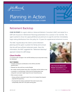
Planning in Action