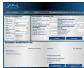
Retirement Needs Analysis Calculator (Produces Client Approved Output)