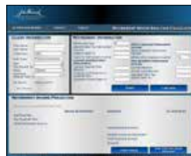
Retirement Needs Calculator (Produces Client Approved Output)