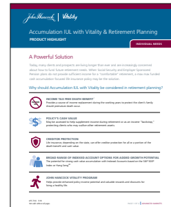
Accumulation IUL with Vitality & Retirement Planning