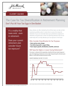
Tax Diversification Client Guide (Client Approved)