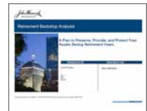
Retirement Backstop Analysis Module (Client Approved)

For agent use only. This material may not be used with the public. Insurance products are issued by: John Hancock Life Insurance Company (U.S.A.), Boston, MA 02210 (not licensed in New York) and John Hancock Life Insurance Company of New York, Valhalla, NY 10595. LIFE-7490 6/18 MLINY102617188